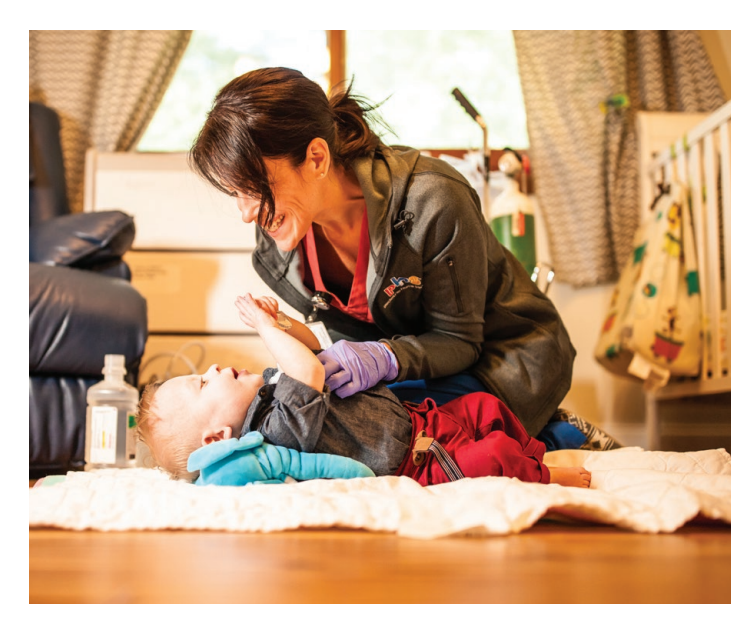
When patients are counting on PHS, PHS counts on MO2 to deliver their medical gas.

believe that our focus on the pediatric, medically complex population, and always keeping customer-service at the forefront of our work has allowed us to continue to grow and thrive as a business."